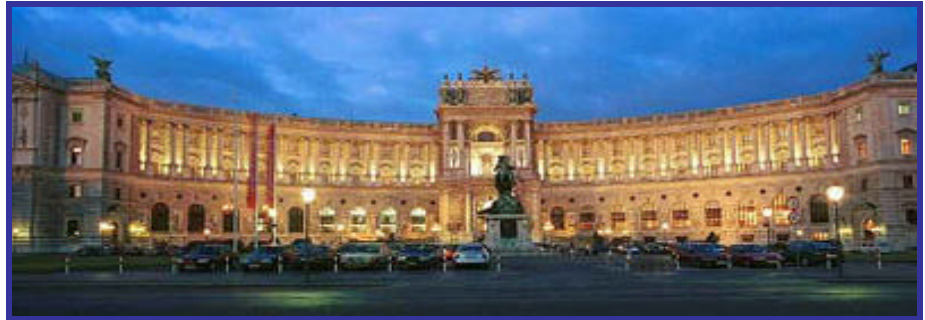
The Hofburg, Vienna