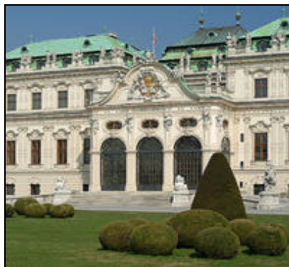
Belvedere Palace, Vienna